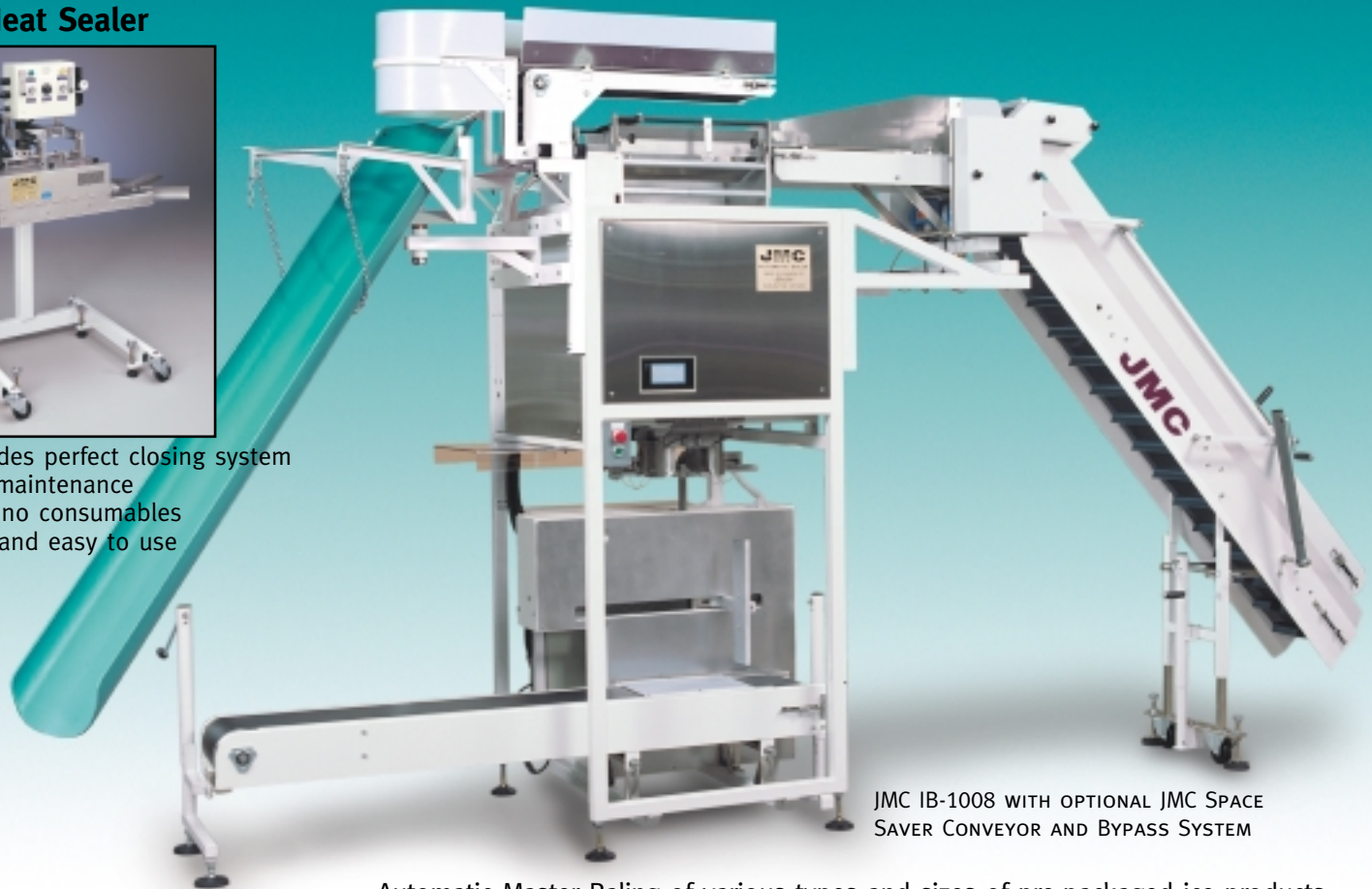
JMC IB-1008 WITH OPTIONAL JMC SPACE SAVER CONVEYOR AND BYPASS SYSTEM

Automatic Master Baling of various types and sizes of pre-packaged ice products. Accommodates product bags with a common width and adjustable length, from all types of manual and automated packaging lines. Consider the optional JMC FuseAire 4 Heat Sealer for a reliable and trouble free Automatic Master Baling system.